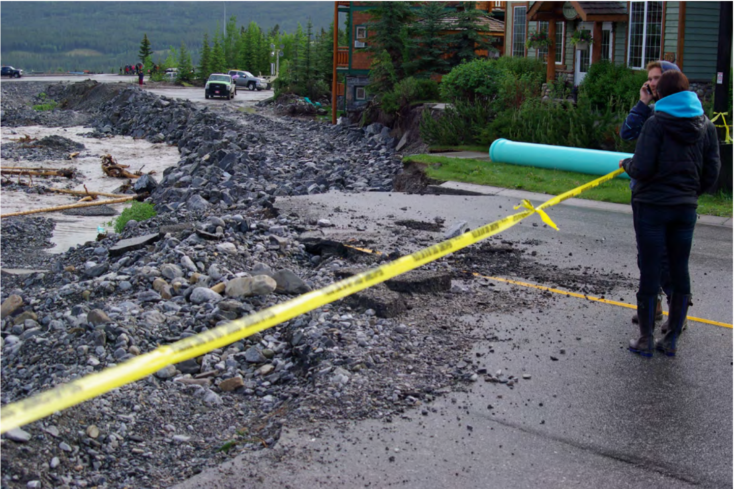
Figure 3. Flood damage in Canmore