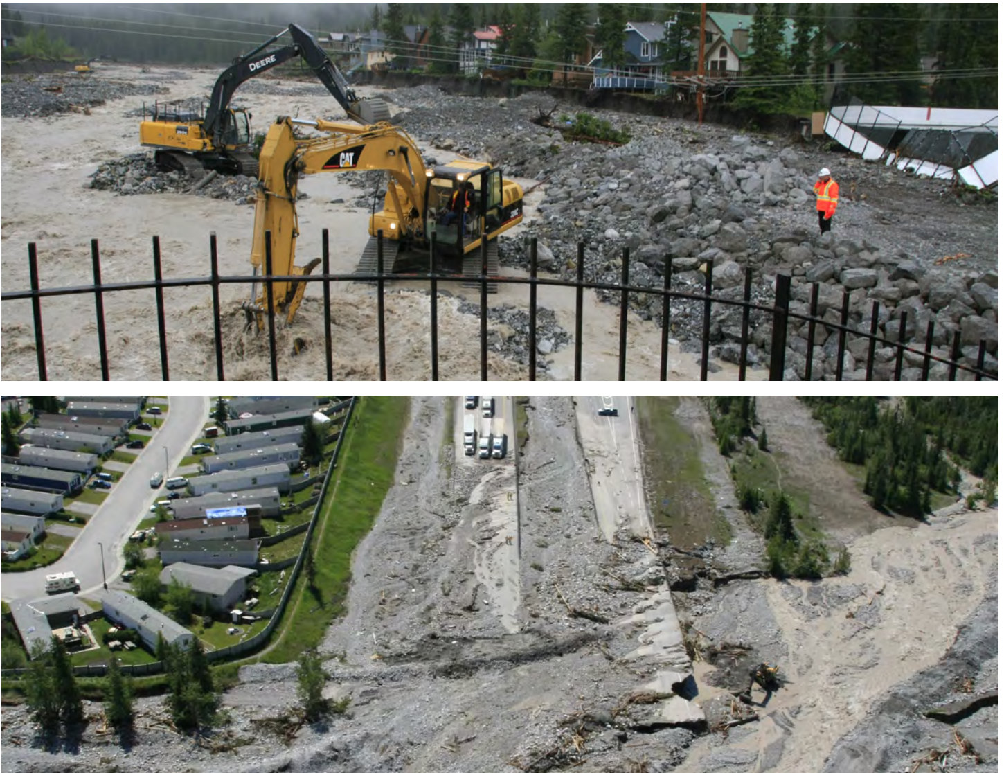
Figure 1. Flood damage in Canmore